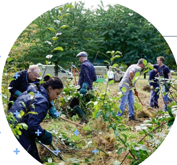
The GPE team working at Burgess Park with the charity Groundwork London as part of GPE's annual corporate Community Day.